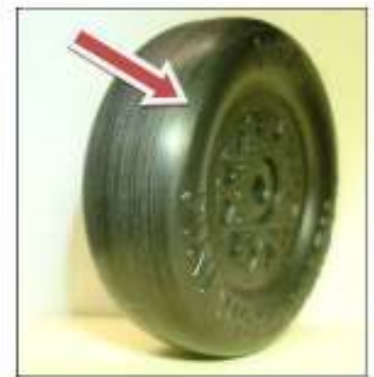
Not good – Fluting not visible