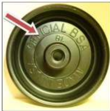
Good – BSA markings visible