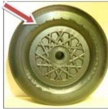
Not good – BSA markings not visible