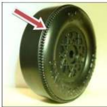
Good – Fluting visible