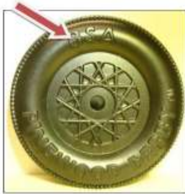
Good – BSA markings visible