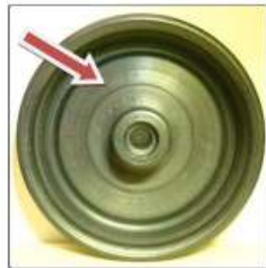
Not good – BSA markings not visible